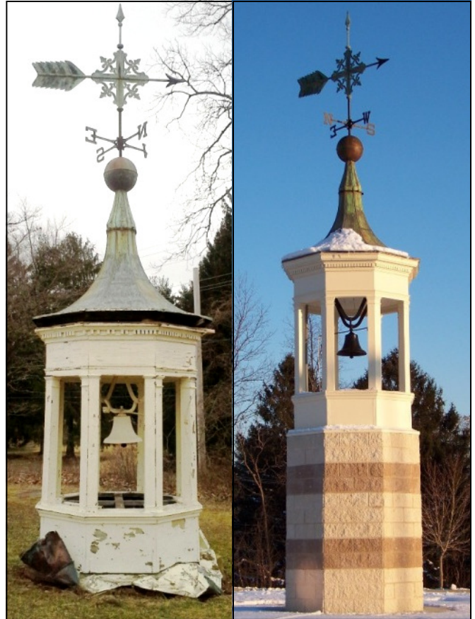
The cupola and its dramatic weathervane before and after its restoration by Roberson Preservation Services, Inc.

present to hear the pealing of the bell and stated, "While we were disappointed that the school could not be saved, I am very pleased to be a part of this great day and commend the school district and the