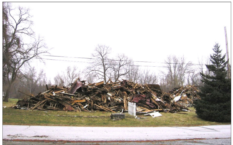
Roger Hunt Mill House, Downingtown, 2008

The Chester County Historic Preservation Network is an affiliation of local organizations and individuals dedicated to promoting, protecting, and preserving Chester County's historic resources and landscapes through education, facilitation, and public and private advocacy.