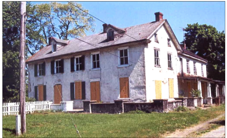
Roger Hunt Mill House, Downingtown, 2007

J n Chester County we have many places that retain their historic character: farms and pastures, crossroads villages, downtowns, and industrial sites. This wealth of historic resources gives us a sense of pride in who we are and knowledge of from where we have come. The stark reality, though, is that most of our historic resources are gone if you take into consideration all of the houses, barns, churches and meetinghouses, stores, offices, mills and factories, fencerows, roads, and bridges that were constructed between 1682 and 1958 (to apply the minimum fifty-year standard for National-Register eligibility). What remains is just a smattering of everything that was here.