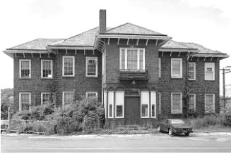
Phoenix Iron Company, Administration Building, Phoenixville