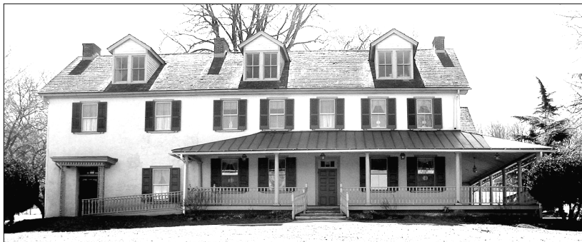
Springton Manor Farm, a county park with active farming, has been in continuous agricultural use for more than 200 years.

Springton Manor Farm, one of Chester County's four Regional Parks, traces its origin to land granted to William Penn in 1681 by King Charles II of England. A debt owed to Penn's father led the King to grant William a tract of land he named Pennsylvania in honor of the elder Penn. The Royal Charter granting this land permitted Penn to reserve 10,000 acres out of every 100,000 as a Manor for his own use. Springton Manor, one of