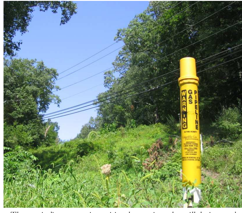
The gas pipelines are coming, raising the question: what will the impacts be to our historic resources, archeological sites, and landscapes?

AES Mid-Atlantic Express will traverse 88 miles from Sparrows Point, MD. to Upper Uwchlan Township. The pipeline would go through 13 Townships and the Borough of Downingtown. It is