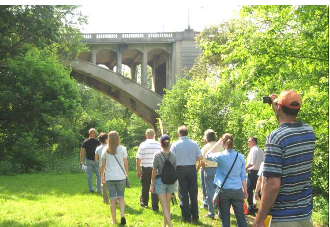
PennDOT scoping in Northampton.

Most of the site's educational resources are available from the home page. Here links take site visitors to the basics of preservation law and regulations, transportation planning and programming, and highlights of important projects and initiatives. The Project Search page is the gateway citizens with