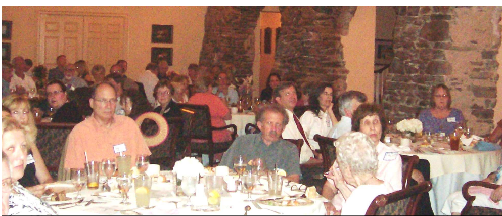
A packed house appreciated the triumphs and troubles of their fellow preservationists during the Roll Call in which each municipality discussed its year of efforts.

CCHPN would like to thank the hosts of the event, Birmingham Township Historical Commission and Radley Run Country Club. Their generosity and support made this night a great success. The evening