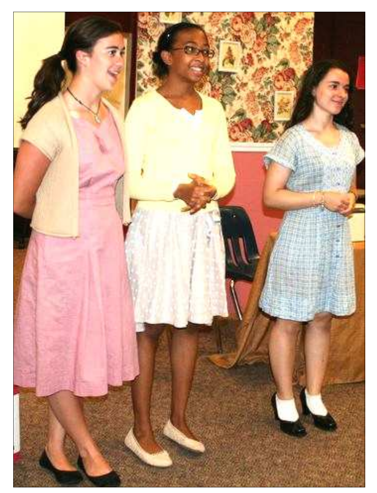
Students from Conestoga High School turned their National History Day research about women in the workforce during WWII into a performance that earned them a place at the 2012 national NHD competition.

Peek through frosty classroom windows across Chester and Delaware Counties and you will find hundreds of students excitedly completing their