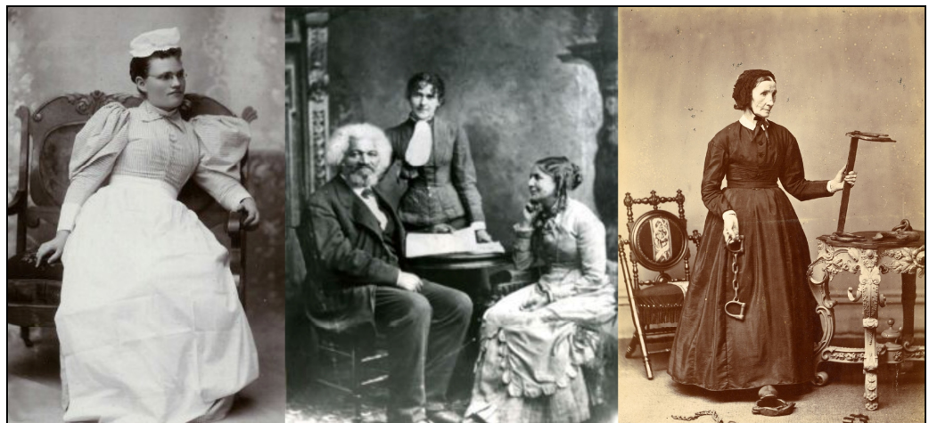
The Real Housewives of Kennett Square

And next summer? Already signed up is Malvern Borough for its 125th Anniversary Celebration; the historic villages of Fricks Lock in East Coventry, Nantmeal Village in East Nantmeal and Birchrunville in West Vincent; and West Chester’s southwest Quadrant.