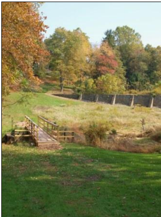
Wolf's Hollow County Park features many remnants of the region's industrial past, nestled within beautiful landscapes.

Hikers can experience the Octoraro from the Chester County bank as well. Wolf's Hollow County Park opened in December 2010 as Chester County's newest park. At the northern tip of the park, the Waterfalls Trail follows an old cart path through stone ruins and offers a close view of the Octoraro. Throughout the park, trails follow old roads and cart paths used to connect numerous charcoal hearths to the forges. The Octoraro Ridge Trail traces the ridge of the Octoraro's gorge, offering spectacular views of the Creek, its gorge, and glimpses of Lancaster County's farms on the tableland to the west.