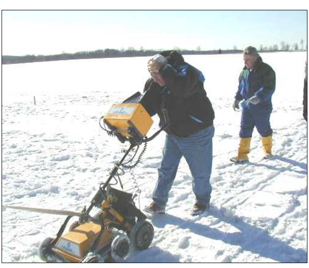
Surface-penetrating radar equipment can even be used when the ground is frozen.

Upcoming events for the Paoli Battlefield, in addition to this lecture, are a fundraiser, Spirits of 1777 at 6 pm at the Gen. Warren Inne on Monday, September 21 ($45/person) and the