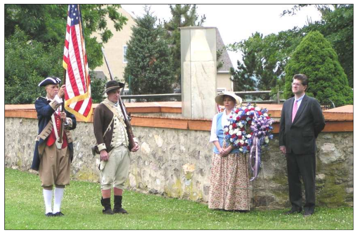
The loss of Continental forces is commemorated annually at the burial site in the Paoli Memorial Grounds.

In a battlefield setting, such investigations can find clusters of musket balls revealing detectors and the revealing profiles from surface penetrating radar uncover hard data on the actual battle instead of relying (Battlefield Restoration and Archaeological on anecdotal accounts from participants.