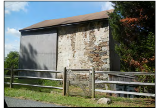
South elevation of Half Barn near Birchrunville.

The “Half Barn” is a historic barn type found in southeastern Pennsylvania. Wise Preservation Planning LLC has surveyed hundreds of barns throughout southeastern Pennsylvania, including several half barns. Little is known about half barns, and in fact they were only identified as a barn type four years ago. Books about barns do not mention Half Barns.