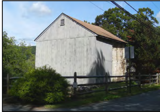
Half Barn near Birchrunville, facing northeast.

This is the first article in a series providing information on understudied elements of the architectural heritage of Chester County. The series should provide important reference information for historical commissions and HARBs that will be of use in the future as you help to document and plan for the future of historic buildings in Chester County