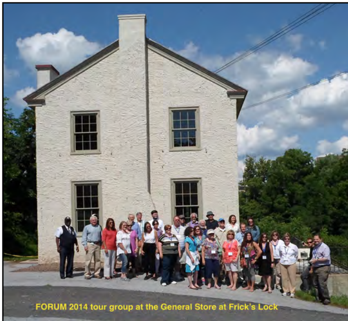
FORUM 2014 tour group at the General Store at Frick's Lock

The CCHPN sponsored two events that summarized Chester County's unique approach to preservation planning. One event was a full-day bus tour attended by twenty-two forum participants from as far away as Alaska and as close as Maryland.