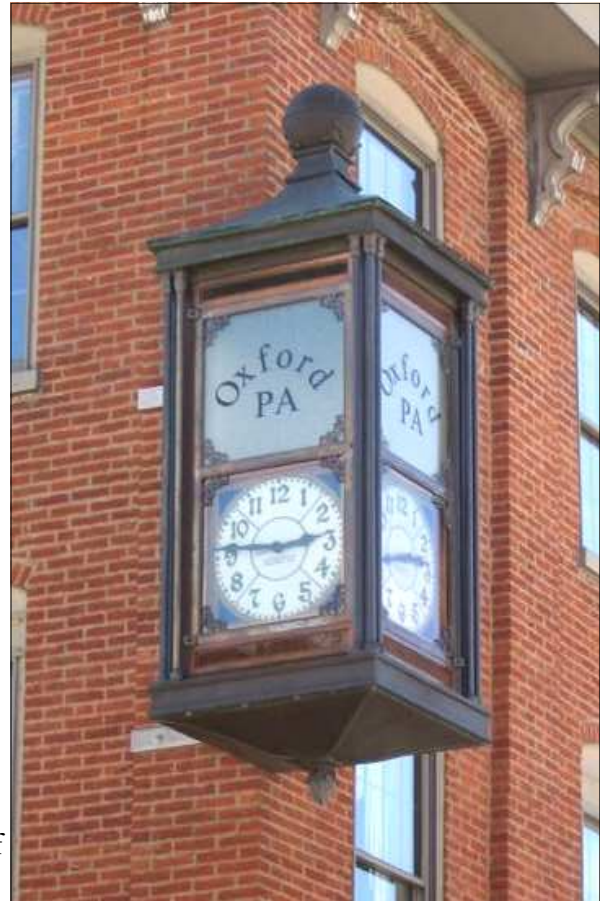
So much of the rich architectural heritage of Oxford remains throughout the historic district.

A witness to the Revolutionary War and American Independence, Oxford grew slowly as the nineteenth century approached, adding several homes, work places for craftspeople, and merchants' shops to its cluster of buildings. Developing its own identity in those years, Oxford won the status of an independent borough and had a functioning government in place by 1838. Linked to the larger world by twice-weekly stagecoach runs, Oxford