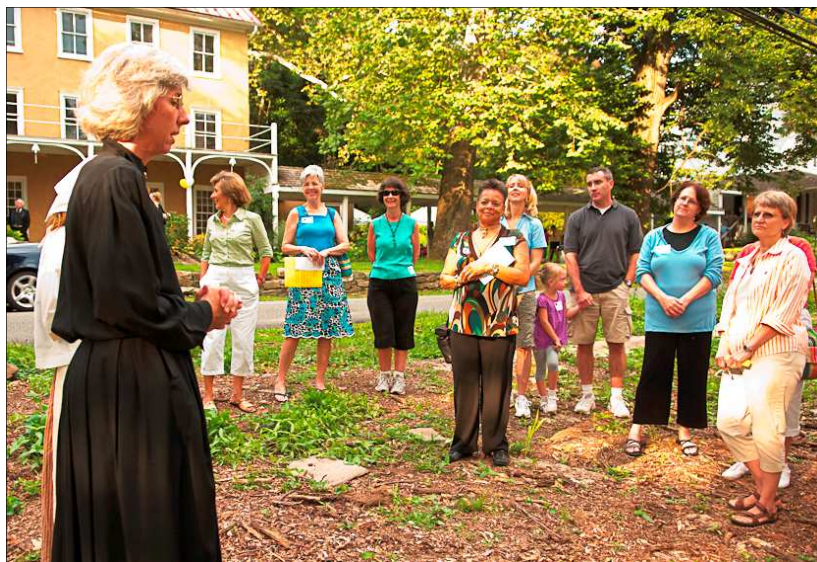
Attendees at last year’s village walk in Historic Yellow Springs were treated to guides in period dress, refreshments, and a demonstration of his-

Sponsor: Fallowfield Historical Society Reservations: 610-857-1824 With Quaker roots that run as deep as those of the oaks that line its Grove, the Village of Ercildoun was a major stop on the Underground Rail Road. It is also the final resting place of Rebecca Lukens and many others who fought to abolish the scourge of slavery . Ercildoun’s appearance has changed very little over the years. Come and discover its many hidden charms!!