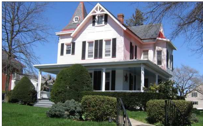
There are many wonderful homes surrounding downtown Oxford.

Modern highway systems and the declining importance of railroads conspired to reduce Oxford's significance in the twentieth century. Some specialty manufacturers, such as