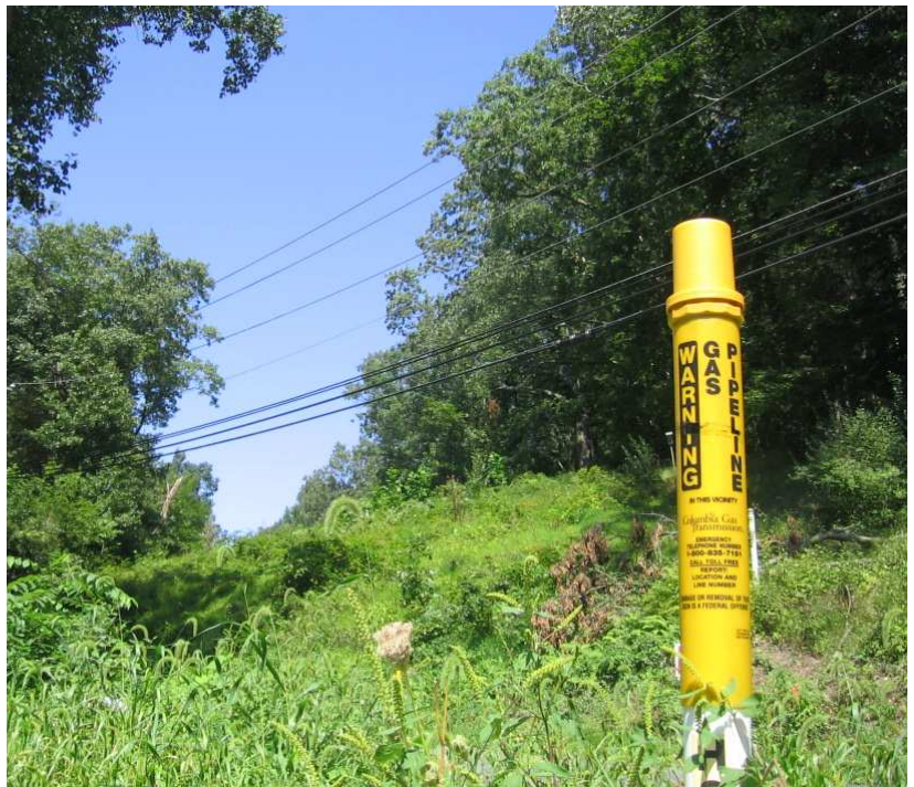
The gas pipelines are coming, raising the question: what will the impacts be to our historic resources, archeological sites, and landscapes?

AES Mid-Atlantic Express will traverse 88 miles from Sparrows Point, MD. to Upper Uwchlan Township. The pipeline would go through 13 Townships and the Borough of Downingtown. It is