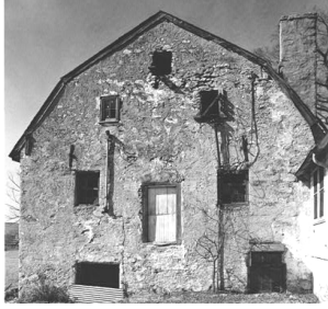
Hunt-Pollock Mill, Downingtown, 1752