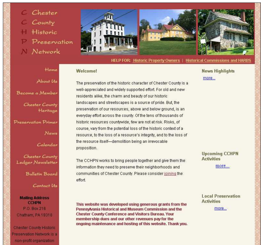
A Screenshot of the Home page.

Help for Historic Property Owners (located under the masthead) provides technical information specifically