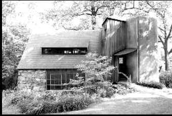
Wharton Esberick House and Studio, Malvern, 1926