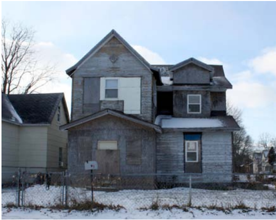
Clockwise South Central, East Central, Industry, Old West End

For example, take a building of average construction quality and medium architectural character that is in fair condition. In a neighborhood like Muncie's East Central, the building would be recommended for stabilization or rehabilitation to support more residential density. In South Central, the same building would likely be recommended for demolition and replacement with a garden or natural habitat, to contribute to the neighborhood's gradual transition away from residential use. Strategies for the same building in Industry or Old West End would vary according to local priorities and plans for nearby properties.